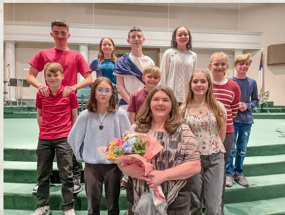
Middle school and high school students performed The Case of the Conspicuous Cross on Thursday, April 25.