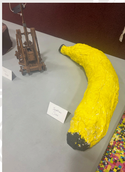
Jonathan Sisco's created a banana for the art show.